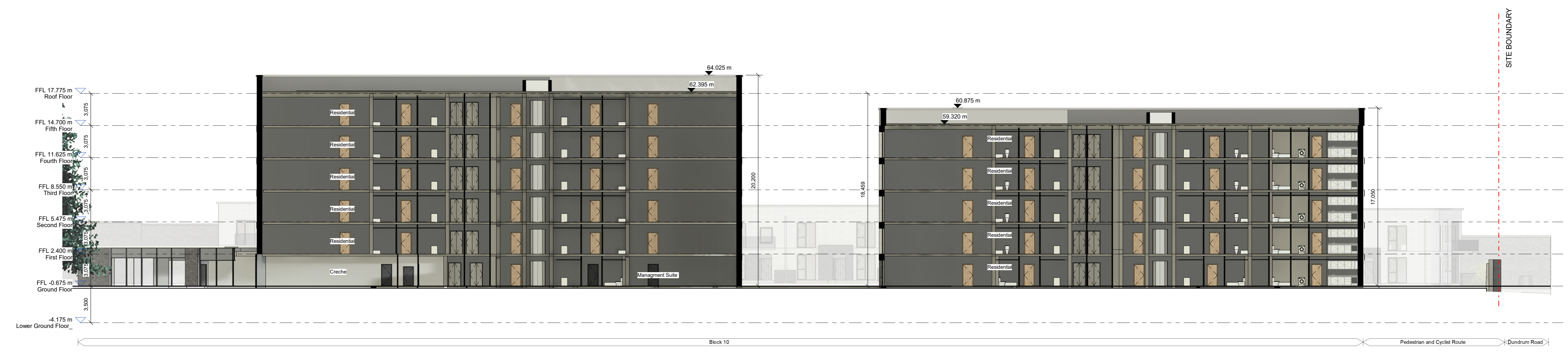
Section 05 1: 200