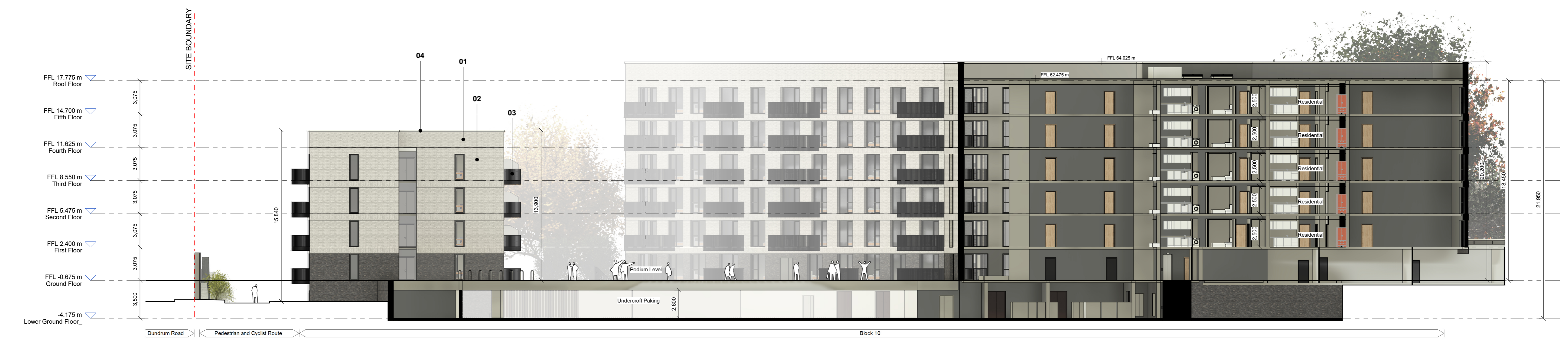
Section 06 1: 200

Notes: Do not scale from this drawing. Use figured dimensions in all cases. Verify dimensions on site and report any discrepancies to the Architect immediately. This drawing to be used in conjunction with the Architect's Specifications. © This drawing is copyright and may only be reproduced with the Architect's permission.