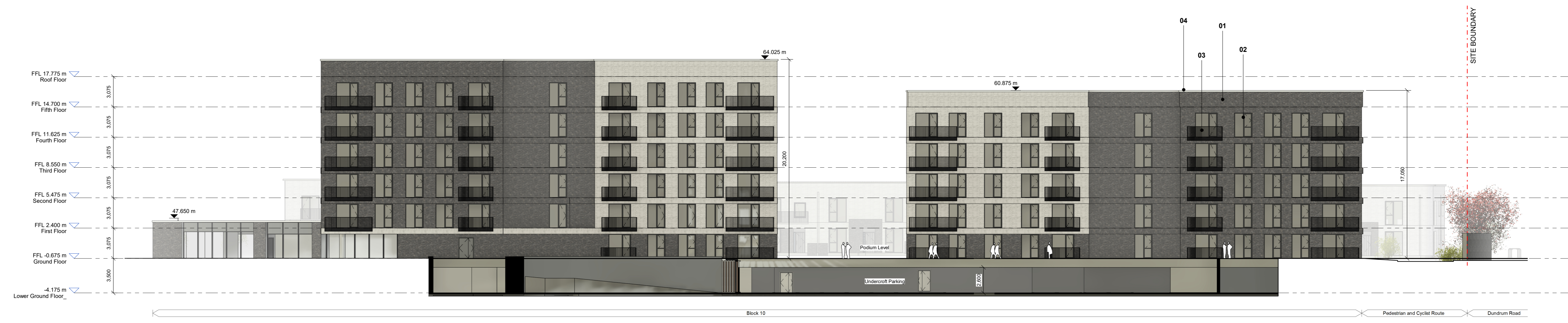
Section 04 1: 200